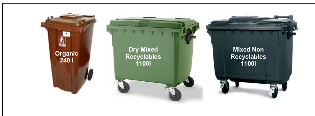
Figure 5.1 Typical waste receptacles of varying size (240L and 1100L)